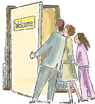
New Member Class